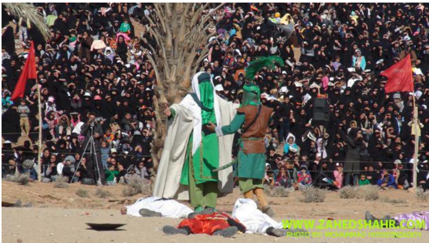
Fig. 1. Ta'zīyeh in the Iranian society

Browne (1902), the author of The Literary History of Persia , has referred to two Iranian and German pieces of evidence in his attempts to identify the founder of Ta'zīyeh rituals. According to Browne (1902), Moezodole Deilami (963 AD) was the first founder of the tragic drama. After he appointed to the Caliph's court in Baghdad, Moezodole declared ten days of mourning from the beginning of the holy month Moharram and ordered all stores to be closed in Baghdad during this time. People were asked to dress in black to show their sadness. This command rendered mourning an official and general rite and later established the foundation for the present form of Ta'zīyeh during the Safavid era (1501 AD-1722 AD) ( Encyclopedia of Iranica , 2008).